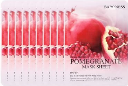
Set of 10pcs.